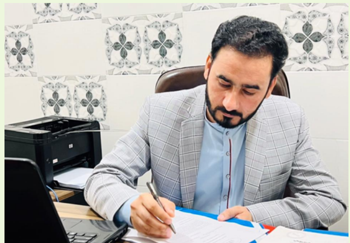
The MIMINUMS Institute of Nursing and Allied Health