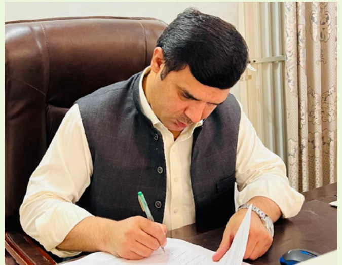
The Himalaya College of Nursing And Allied Health Sciences

In a commendable effort menstrual health education and encourage women's well-being, the #LIMEPakistan outreach team has reached 88 educational institutions and forged ties with a total of 20 institutions, comprising 15 in Mardan and 5 in Charsadda. We are excited to highlight 4 notable partnerships with highly recognized nursing colleges in Mardan which are highlighted in the list.