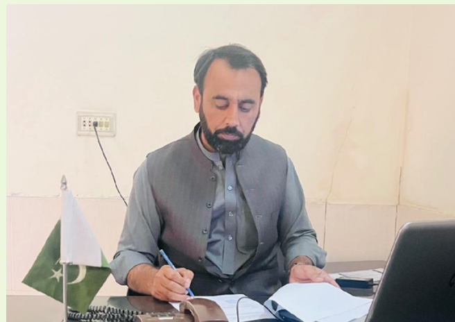
The Pakistan International Public School

These nursing institutions will help us find committed interns to #LIMEPakistan, encouraging a valuable exchange of knowledge and expertise also their teachers have extended invitations to participate in upcoming training sessions. Our team is optimistic about the positive impact collaborations will have on the community.