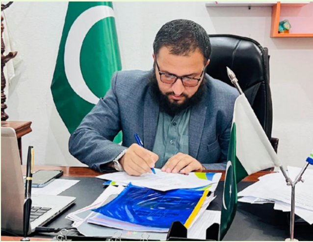
The Oriental Institute Of Nursing And Allied Health Sciences