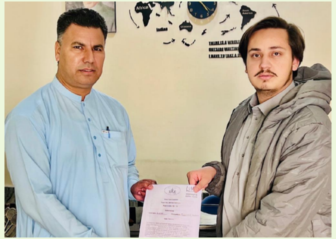
The Al Fajar Institute Of Nursing & Allied Health And Sciences